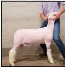
ALL ABOUT THE JUNK